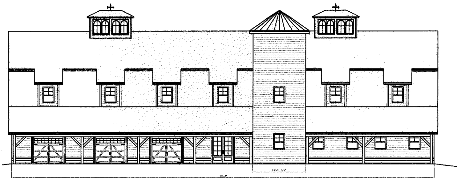
EAST ELEVATION SCALE: 3/16"=1'-0"